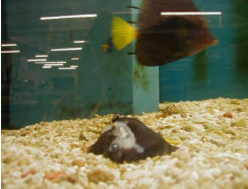
Dead fish in dirty aquarium.