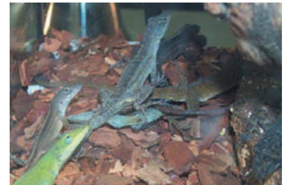
Overcrowded lizards walk over their own dead.

PETA's staff has filed reports against PETCO with local law enforcement agencies since 1999. PETA has also urged PETCO, at a bare minimum, to train its employees to provide veterinary care for all animals in its care and to screen buyers. Yet, conditions at PETCO have worsened. Now PETA is demanding that the chain stop selling animals altogether.